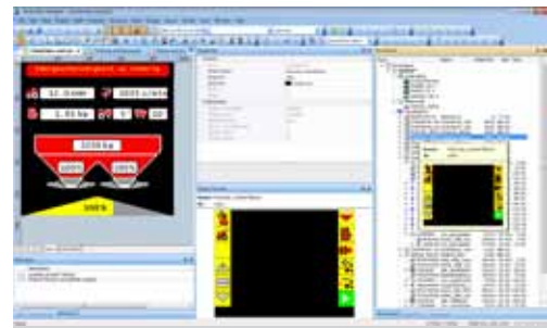
Everything at a glance

Optimum project management is achieved by presenting the objects in a clear tree structure with a preview function. The ISO-Designer supports all specified levels of the standard. When you create a new project, you are free to choose which specifications should apply. The automatic color space conversion of imported images always ensures compliance with the ISO standard.