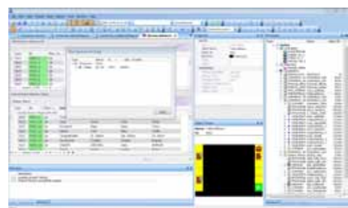
Fast, efficient language management

With the ISO-Designer, multilingual masks are especially simple to create. A resource file saves all the necessary information. The relevant texts are displayed depending on the active language. The resource file can also be exported as a table and imported again, which substantially simplifies external translation of the texts.