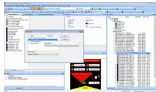
Optimized for the practice

Profit from numerous convenient functions which ease your daily work. This way, even the work interface can be customized to your individual needs. All functions first go through an intensive practical test before they are finally integrated into the program.